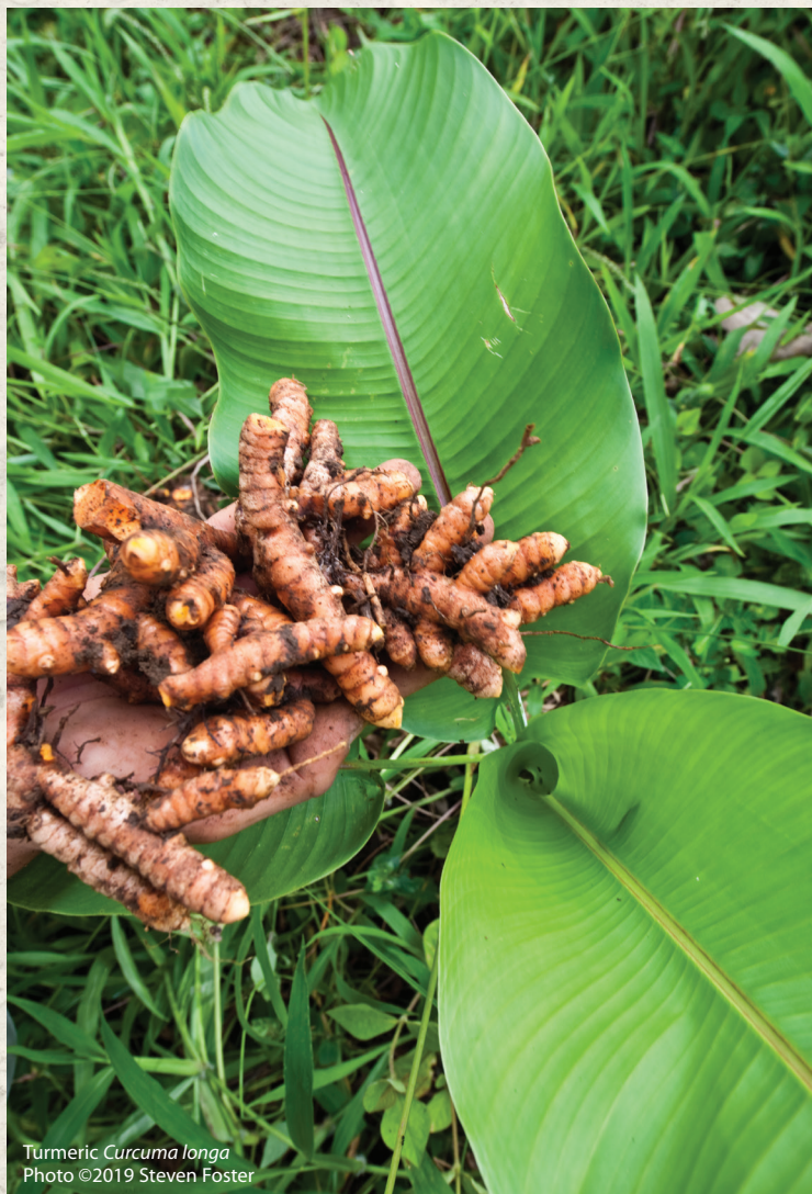
Turmeric Curcuma longa