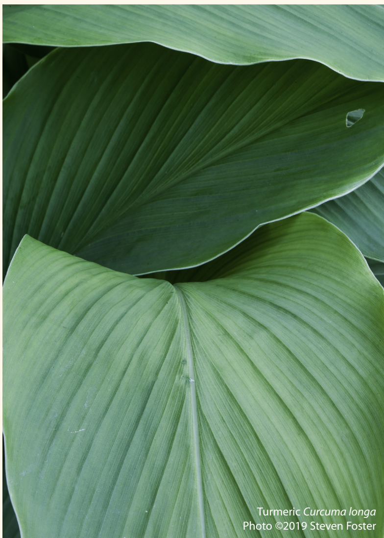
Turmeric Curcuma longa

The oral bioavailability of BCM-95 (designated as NMXCC-95) in dogs § was assessed using a crossover study design with a one-week washout between tests. The study included six healthy male and female adult dogs (12-15 kg body weight; three to four years old). The animals were divided into two groups of three dogs each and administered BCM-95 or curcuminoids (2 g) following a 12-hour fast. Blood samples were taken before administration (time 0) and at 1, 2, 3, 4, 5, 6, and 8 hours post-dose. Plasma samples were weighed, extracted with ethyl acetate, evaporated, then reconstituted in methanol and analyzed by high-performance liquid chromatography (HPLC) with detection at 420 nm. The resulting C_{max} was significantly (3x) greater with BCM-95; approximately 300 ng/g compared to 99 ng/g for curcumin ( P < 0.5 ). ** The AUC_{(0-8h)} also was significantly greater, roughly 1400 ng/h/g compared to 200 ng/h/g. The