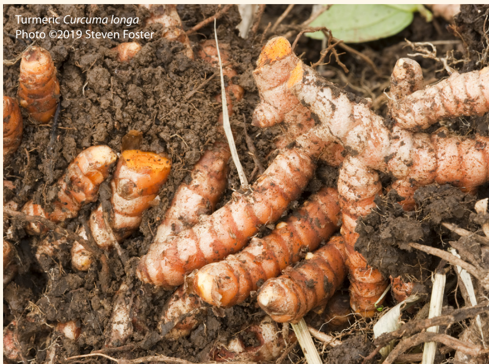
Turmeric Curcuma longa

Safety parameters were examined in a clinical study with patients with Alzheimer's disease. 30 In this study, patients over 50 years old (N = 27, males and females) with a progressive decline in memory and cognitive function over the previous six months received 1 g or 4 g of BCM-95, powdered curcumin, or placebo, in addition to 120 mg standardized ginkgo leaf extract (no description provided) and any additional treatment deemed appropriate by their physicians.