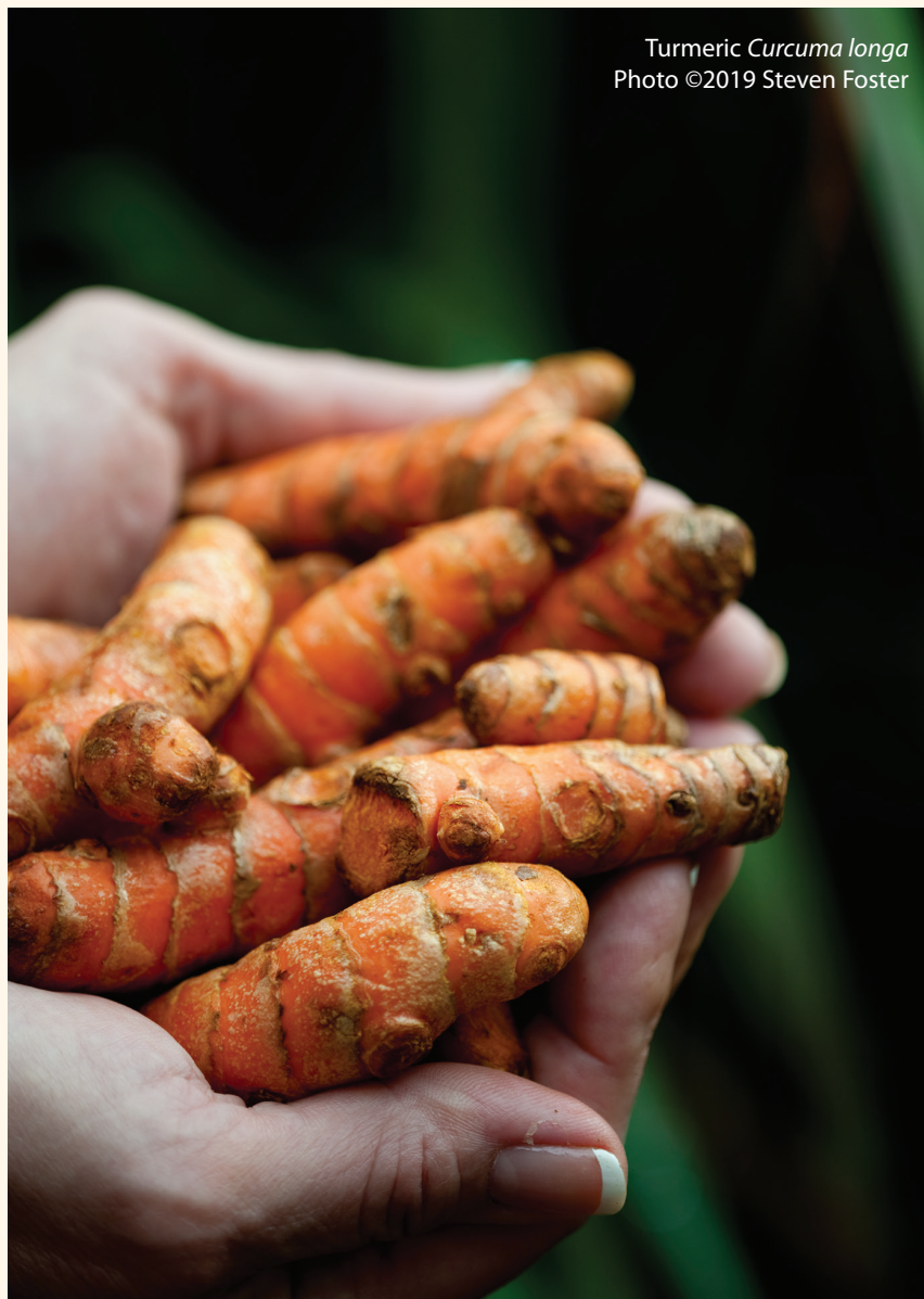
Turmeric Curcuma longa

The ORAC (oxygen radical absorbance capacity) assay provides a measure of the scavenging capacity of antioxidants against the peroxy radical, one of the most common reactive oxygen species in the human body. The activity is measured against Trolox, a water-soluble vitamin E analog, which serves as a calibration standard. Results of the ORAC assay are reported as micromole ( \mu mol) Trolox equivalent (TE) per gram. Two lots of BCM-95 were tested in the ORAC assays and reported to have a total of 13,115 56 and 15,504 57 \mu mol TE/g. The water-soluble fraction of the two lots displayed antioxidant capacities of 7,613 56 and 12,617 57 \mu mol TE/g, which was calculated to be 58% and 81% of the total activity. The remainder of the activity was due to lipid-soluble compo-