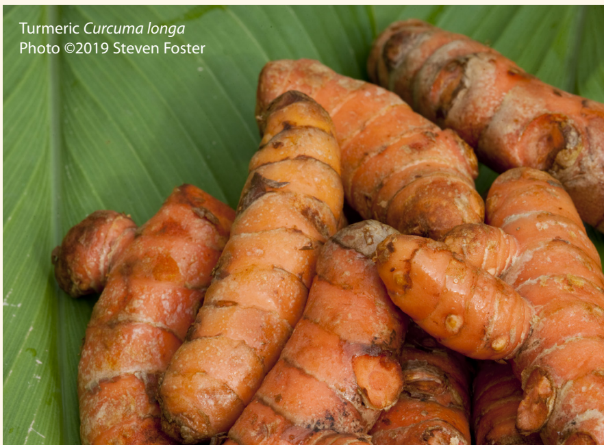
Turmeric Curcuma longa

A randomized, observer-masked (single-blind), three-arm, parallel study was conducted comparing BCM (500 mg twice daily) to fluoxetine (20 mg/day) and the combination of the two treatments given to patients with major depressive disorder (MDD) for six weeks. 27 The patients were men and women with a mean age of approximately 37 years,